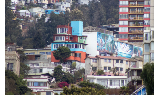
Museums & culture