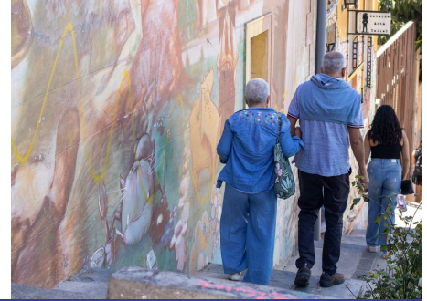
Stroll through Alegre and Concepción Hills: street art, cafés, and heritage architecture